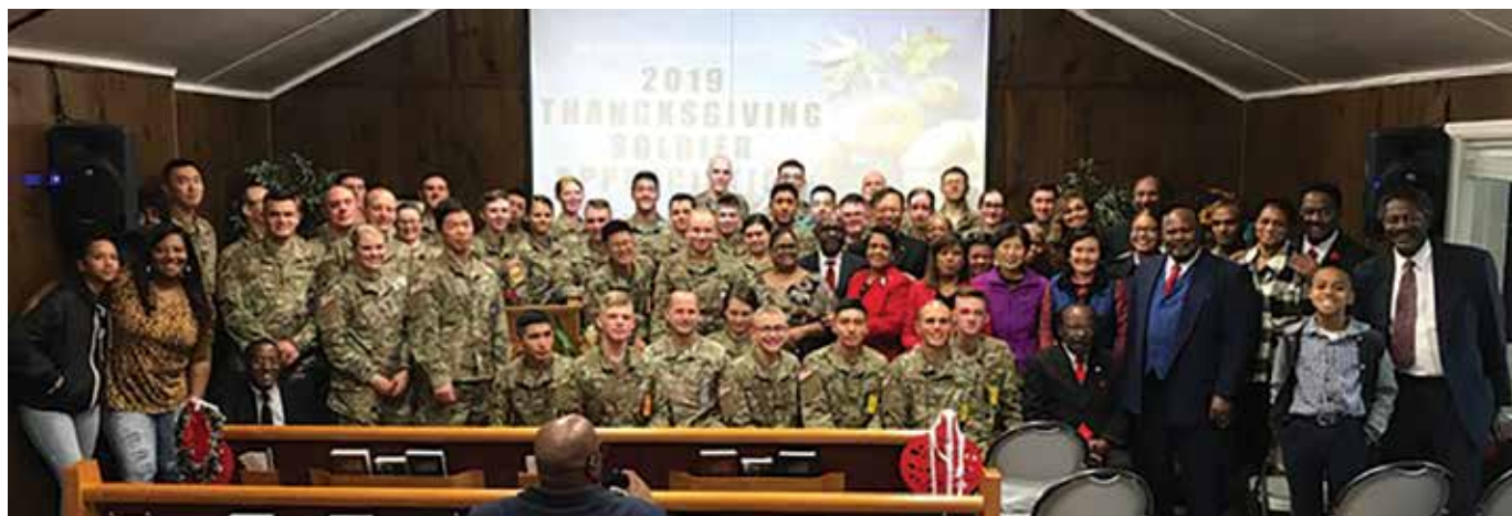
SUBMITTED BY: CHEOL SOO HAN