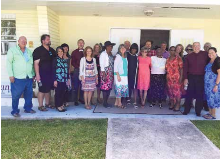
A year ago, a small group of five people prayed 10 days for the Lord's counsel to help them know what to do in the community. There are now 25 people attending church services every Sabbath morning.