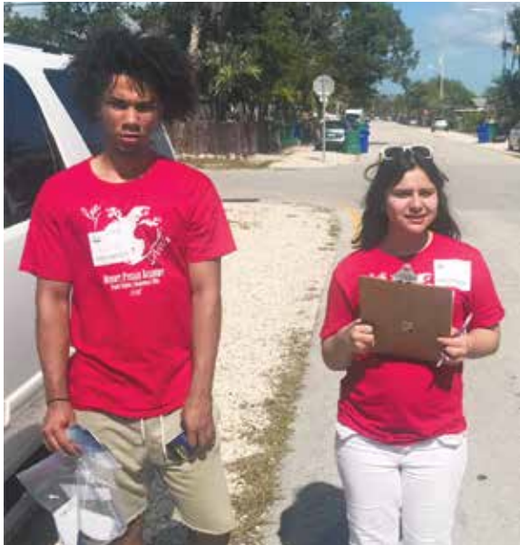
Two students were part of a mission group from Mt. Pisgah Academy in Candler, N.C., that helped pass out surveys to the residents of Key West, Fla.