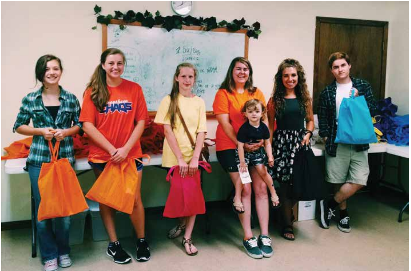
Young people pack school supply bags for a community giveaway in 2015.

For more than 10 years, the Laurel, Mississippi, Church has made a dedicated and intentional effort to reach young people for Jesus. It has become an integral part of their identity as a local church, and it's working. Young people who are affiliated with the church have an experience with God that will not soon be forgotten. Children, teens, and young adults are introduced to a relationship with Jesus