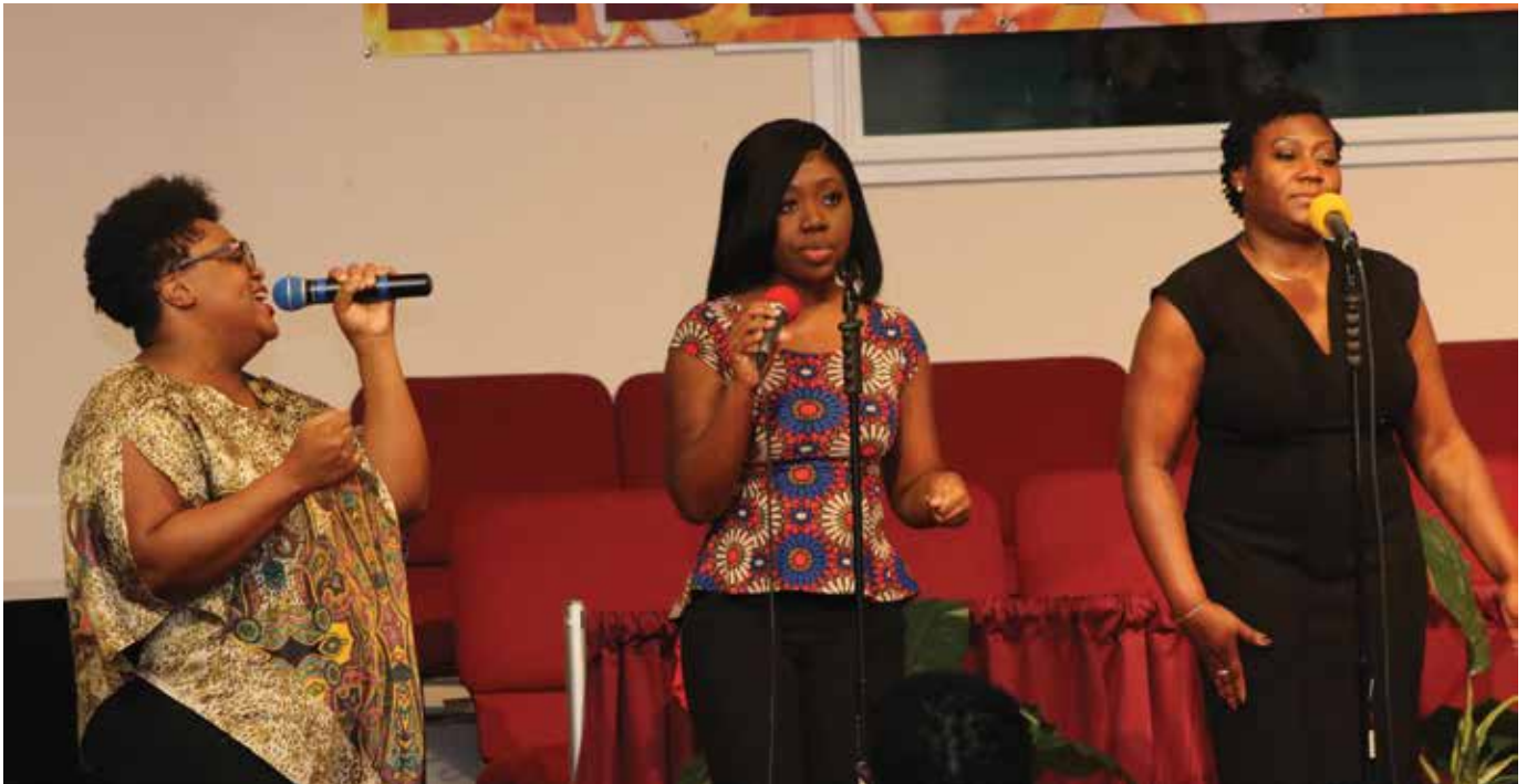
Praise team performers