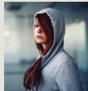
Source: United States Department of Housing and Urban Development, Community point-in-time count, January 2018.