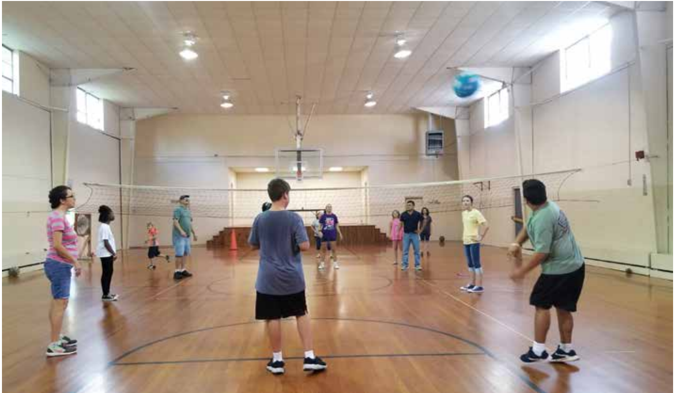
Attendees of the Family Fun Fest play volleyball as part of the “Let’s Move Day” event.

Central Church in Huntsville, Ala., has been utilizing their school facility, Big Cove Christian Academy in Owens Cross Roads, Ala., to impact the surrounding community gently.