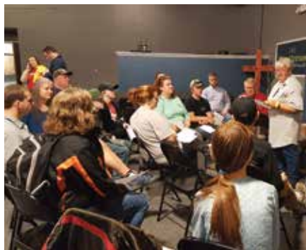
Volunteers are trained before being sent out to participate in the relief effort following the tornadoes.

As the family proceeded from door to door, many opportunities for prayer and