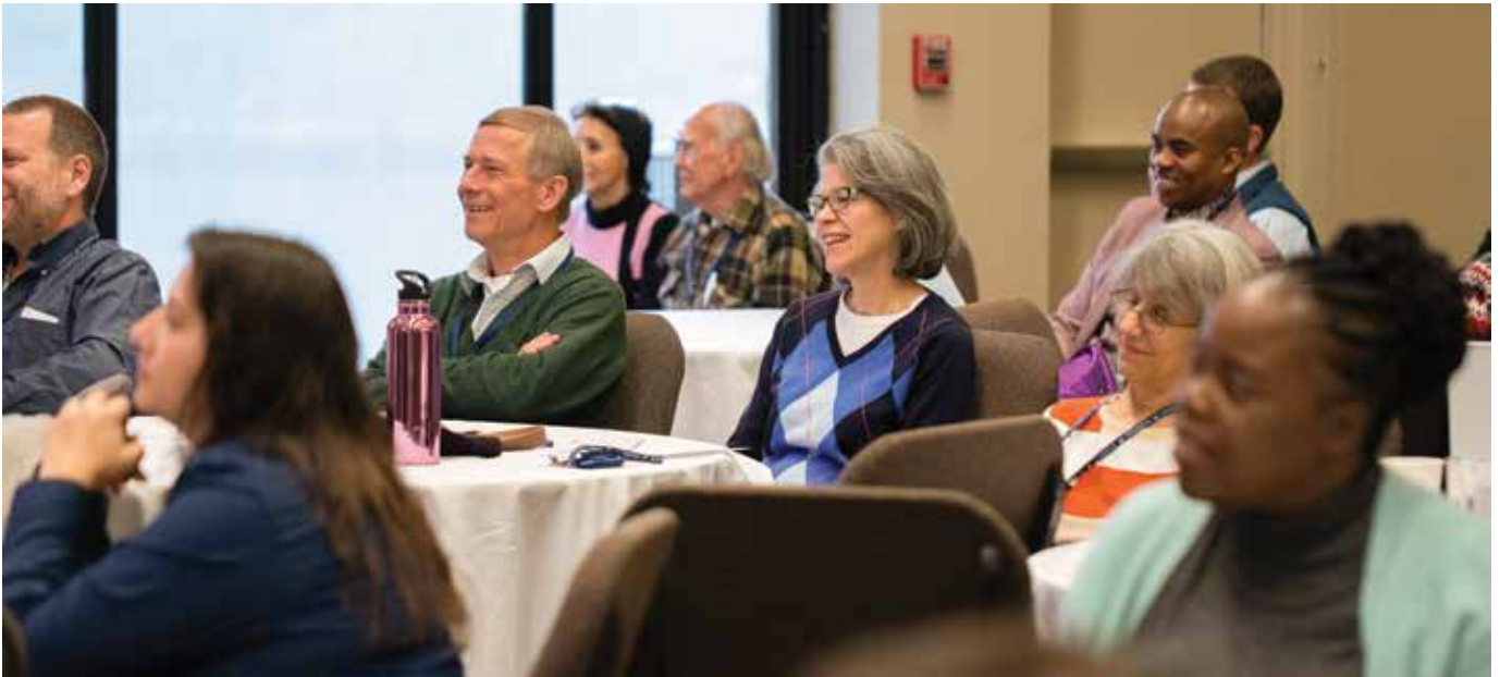
Attendees enjoy the presentation.