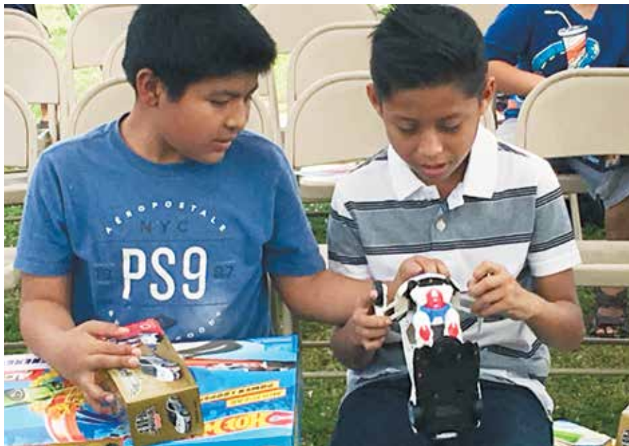
Figuring how a new toy works is fun, but sharing it with a friend is even better!