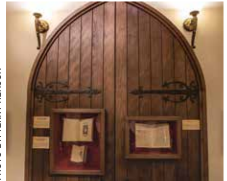
On a replica of the Wittenberg doors hangs an original printing of Martin Luther’s 95 Theses.