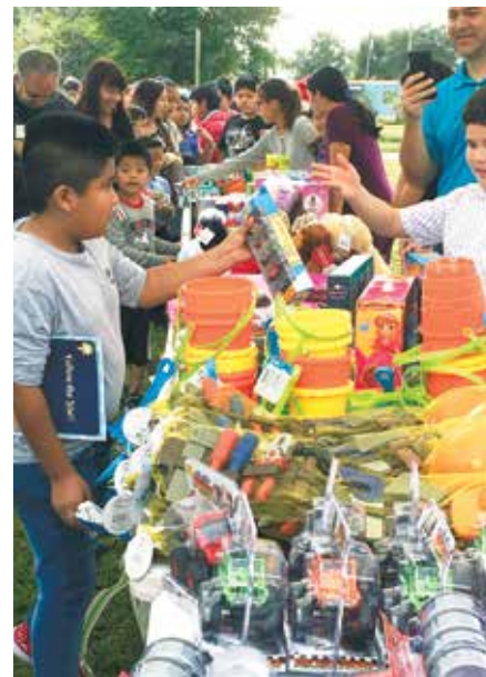
So many toys to choose from as each child is allowed to pick two at the Clewiston, Florida, Toy Rally.

On a balmy 79-degree December afternoon, children and parents from the Clewiston, Florida, Spanish Company neighborhood began strolling onto the church grounds. More than 75 children took advantage of the opportunity to join in a toy giveaway and select two toys of their choosing.