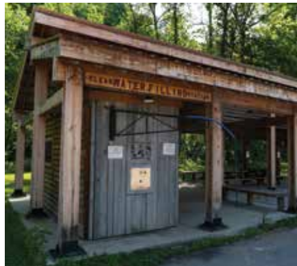
AdventHealth Manchester helped build two water kiosks to improve access to clean drinking water in the Manchester, Kentucky, community. The hospital is planning to partner with other organizations to build two more.

AdventHealth Manchester finds various opportunities to combat social maladies and care for the underserved,