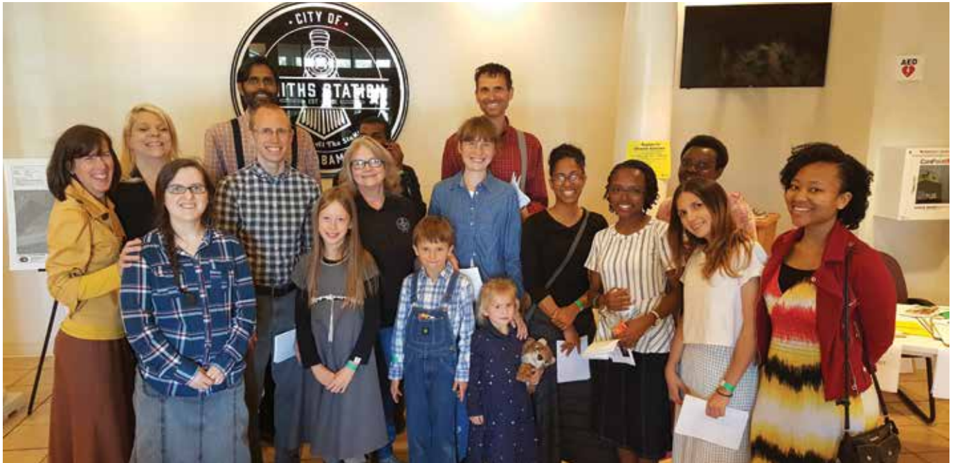
The group from Uchee Pines checks in at the City Hall in Smiths Station, Ala.