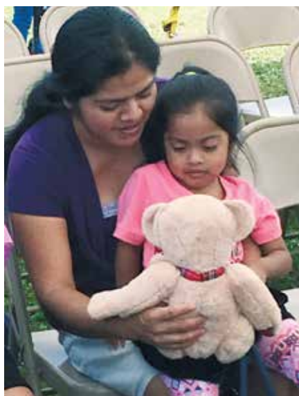
A mother shares in the joy of a new toy with her child.