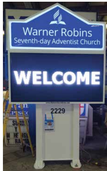
The new marquee sign for Warner Robins Church, Warner Robins, Georgia, receives quality control checks at the factory before being shipped to the church.