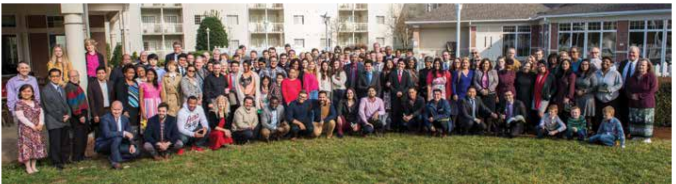
Attendees of the 2019 Southern Union Literature Evangelists' Retreat

Early this past January, the Home Health Education Service literature evangelists gathered in Pigeon Forge, Tenn., to celebrate God's