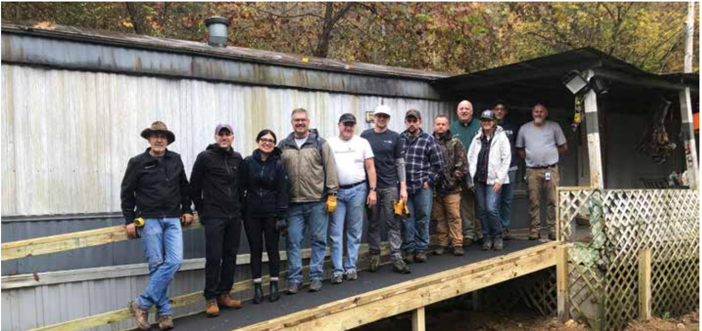
As part of the Healthy Homes project, a team from AdventHealth constructs a ramp to improve a resident’s access into their home.

is actively involved in several community projects: construction and repairs in the homes of patients living in unhealthy conditions, a proliferation of kiosks that provide clean water to residents, a Christian academy, a homeless shelter, and an outdoor youth organization.