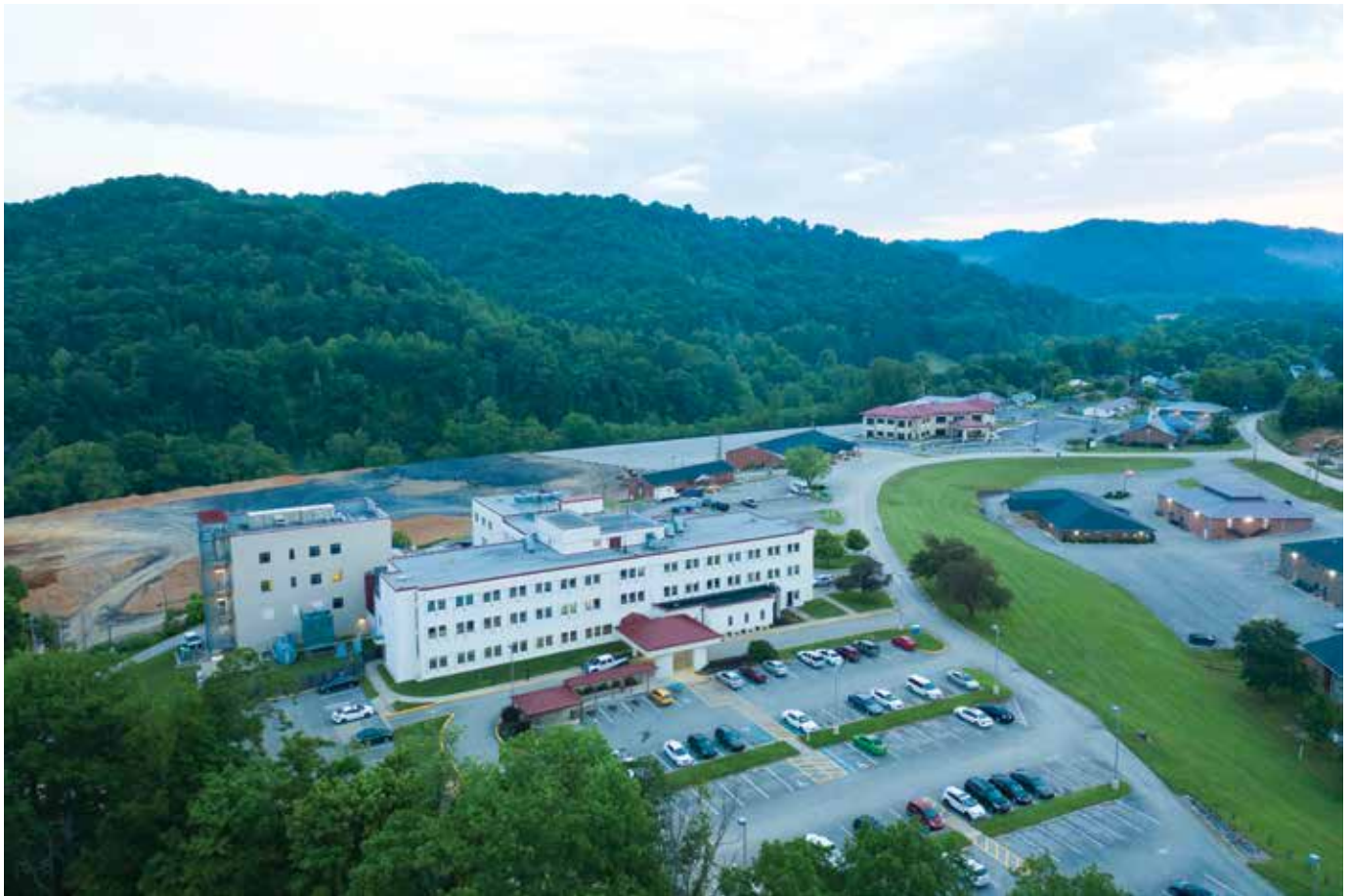
AdventHealth Manchester in Kentucky, one of AdventHealth's 15 facilities to receive a 'Top Hospital' designation, extends its mission beyond hospital walls.

AdventHealth Manchester, named a Top Rural Hospital by the nonprofit health care ratings organization The Leapfrog Group, is recognized nationally for its quality and patient safety. But in Clay County, Kentucky, the community knows the hospital for so much more.