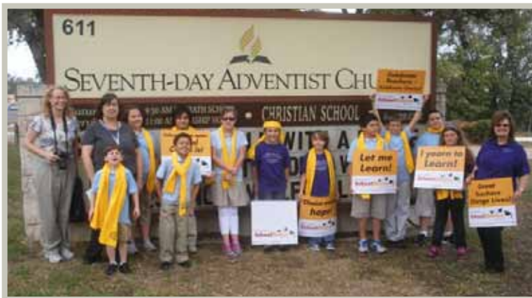
Students released yellow balloons in honor of National School Choice Week in early February.