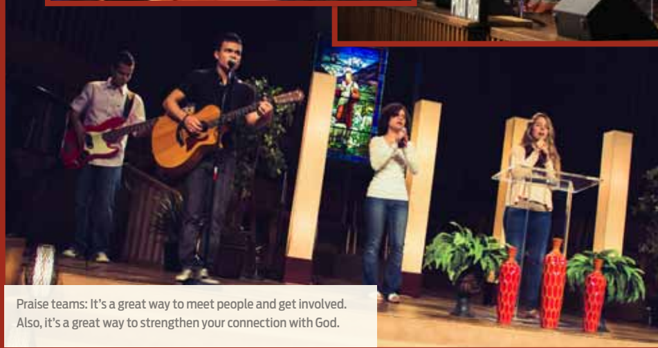
Praise teams: It’s a great way to meet people and get involved. Also, it’s a great way to strengthen your connection with God.

there and we just hang out and sing. I’m always singing! Sometimes I feel like my praise isn’t worthy, but I can give what I have. God gave me my voice and my talent to sing, so I use it for Him.”