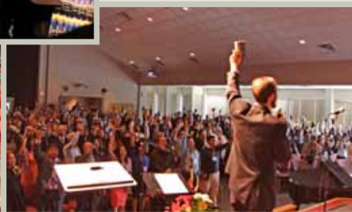
▲ The 550 people attending the first Great Controversy Congress hold up Ellen White’s book to express their enthusiasm for finishing the work.