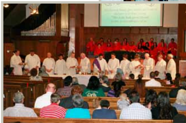
◀ The breaking of bread during the Communion service.