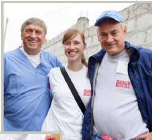
The doctors who accompanied the mission!

Our medical team had three doctors, a couple of dentists, and several assistants who saw 768 people, many of them chil-