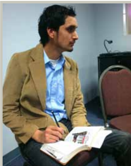
University students spend time 'going deeper' into God's Word.