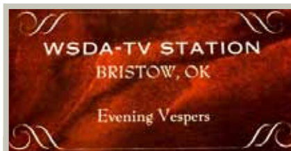
The Bristow church held a special evening vespers on the subject of Black heritage, using a radio broadcast format.