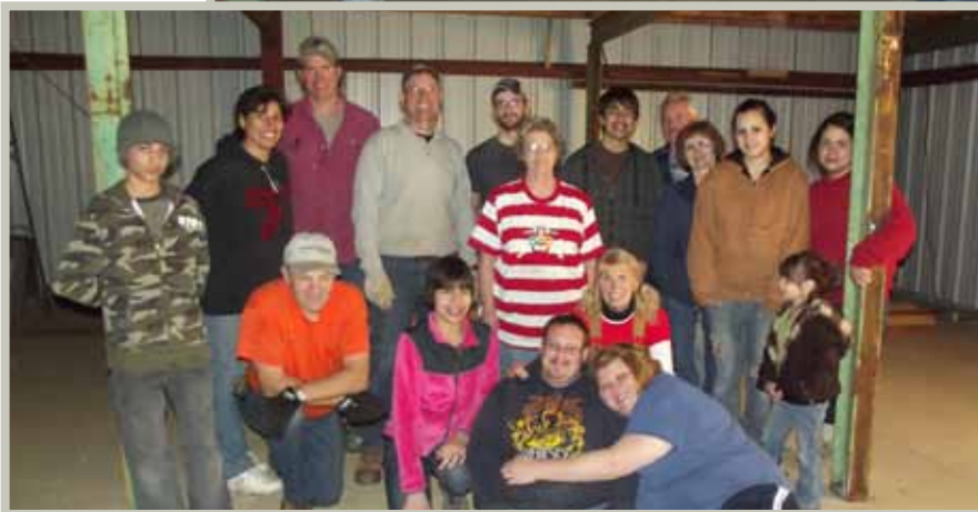
The Antlers church recently had a work bee for the new church building.