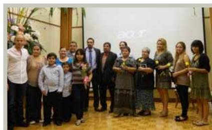
As a result of an evangelism campaign, 14 new members were baptized into the McAllen Jordan Spanish church.