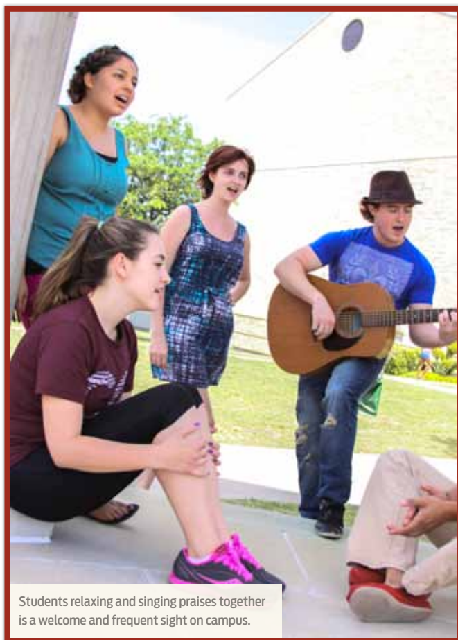
Students relaxing and singing praises together is a welcome and frequent sight on campus.

“It’s just one of many ways to express gratitude for all that God