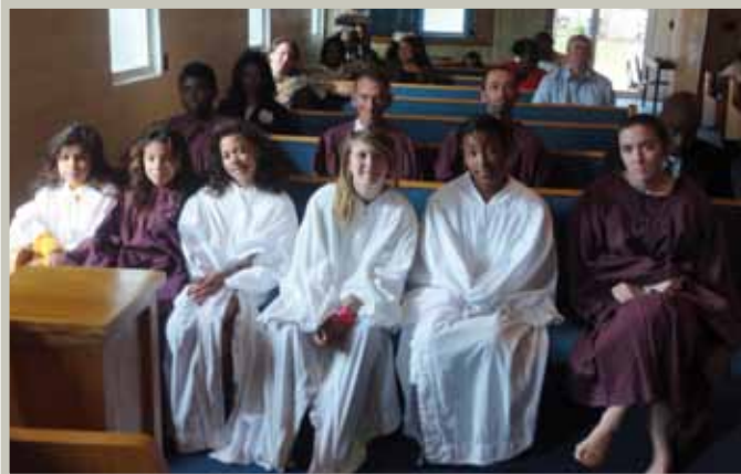
Following the revival at Love's Chapel church, 21 people were baptized. Seated in baptismal gowns are some of them.