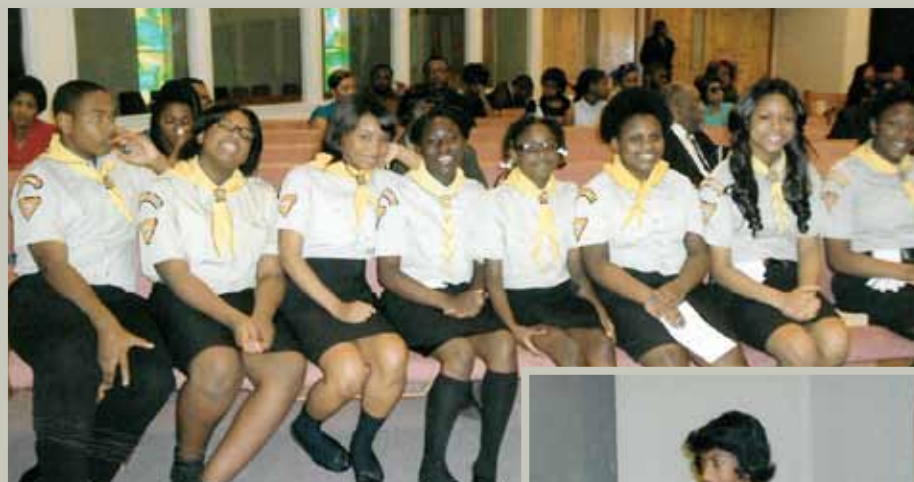
▲ Pathfinders enjoyed the Sabbath celebration.