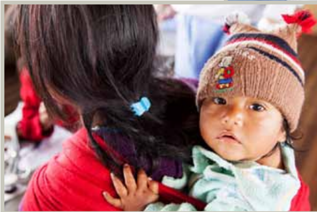
A mother with child awaiting treatment in Ecuador.