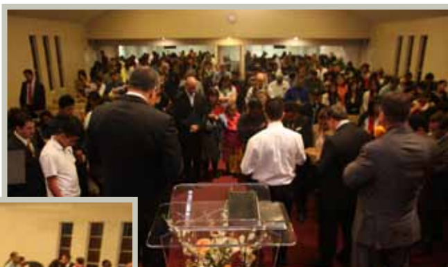
The Texas Conference's evangelism training spanned five cities across the state, and more than 3,000 people attended.

more than 3,000 people attended the seminars. If you would like information about next year's evangelism training or would like to volunteer to