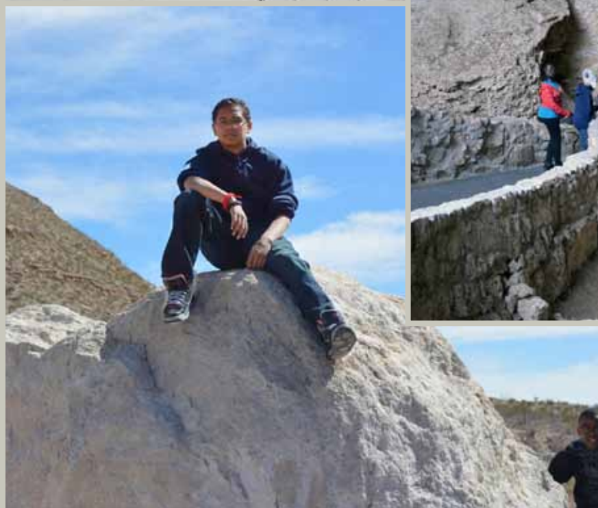
Above left: El Paso Northeast Navigators Pathfinder and Adventurer clubs pose for a photo outside Carlsbad Caverns.