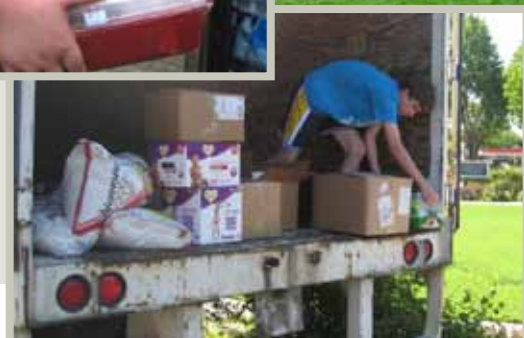
TAA students, led by their teachers, gladly gave up their “fun day” to help Moore tornado victims. Many parents and local church members also assisted in the effort.