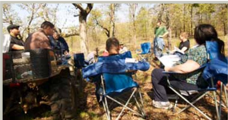
Church members gathered together on the new property to make building plans.