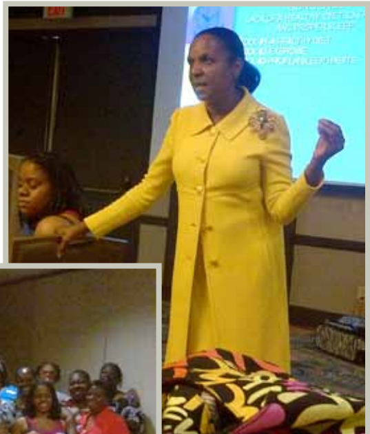
The Tenth Street church hosted “Empowering Our Women Thru the Power of Prayer” on May 18.