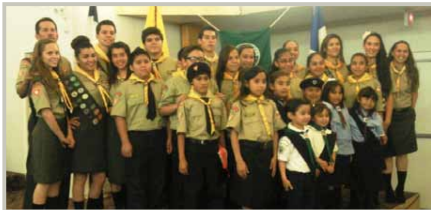
Pathfinder and Adventurer clubs of the El Paso Meraz church conduct Week of Evangelism.

The program began each evening with a film on the life of Jesus according to Matthew, then selected Pathfinders led the theme song. The Adventurers presented a health nugget, while other Pathfinders presented various parts of the program, including the sermon. The church supported our youth with an average attendance of 50 each night, including several visitors that were brought by Pathfinders, Adventurers, or church members. It was a blessing to those who attended. Currently, 20 people are taking Bible studies.