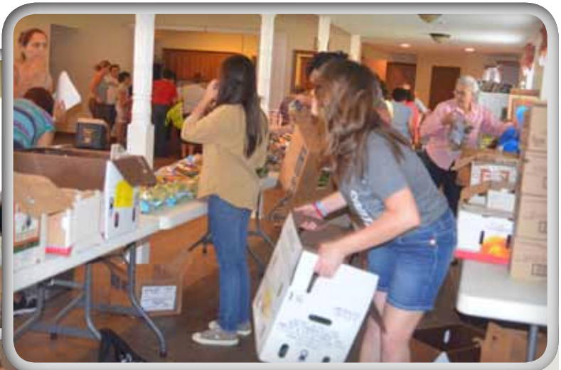
Jóvenes ayudando a su comunidad con una sonrisa y manos amigas. Izquierda: La iglesia abre las puertas del comedor para servir a personas de todas las edades. Arriba: Los miembros de la iglesia motivados a servir.