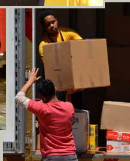
Top: Any age can help! A Southwestern student helps a young volunteer with a heavy box.

▲ Southwestern students and staff help sort the donations.