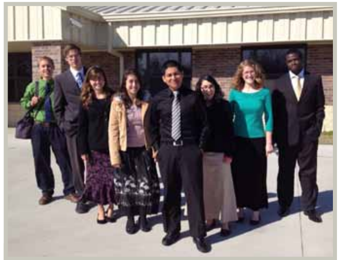
Ouachita Hills College students worked in the Ardmore community doing business-to-business colporturing.