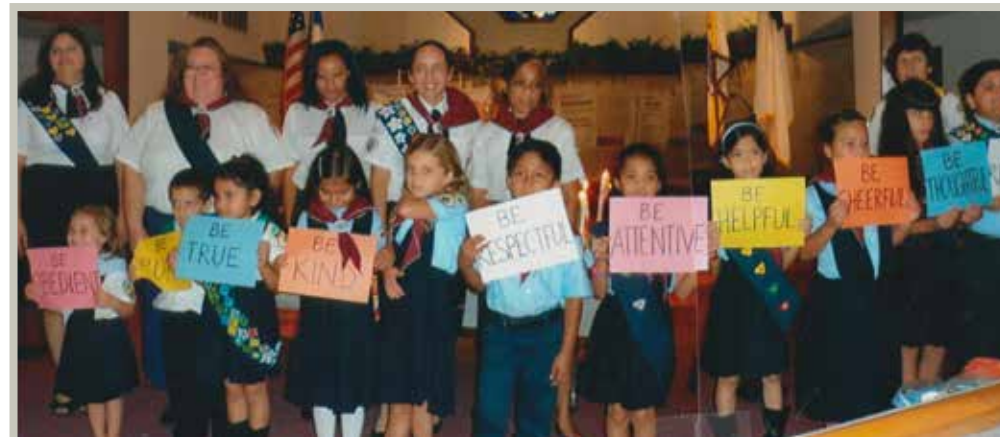
Induction of the Baton Rouge Adventurers.