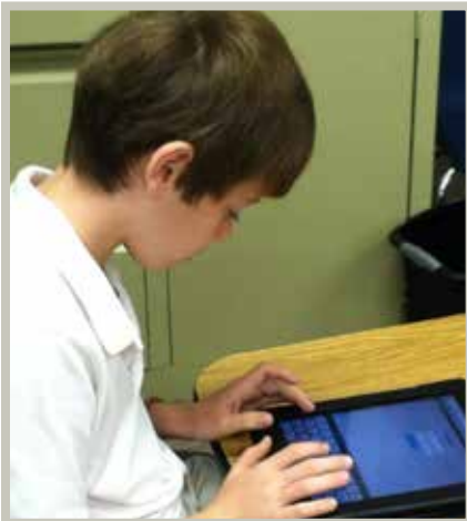
Colquitt Christian Academy student using an iPad.