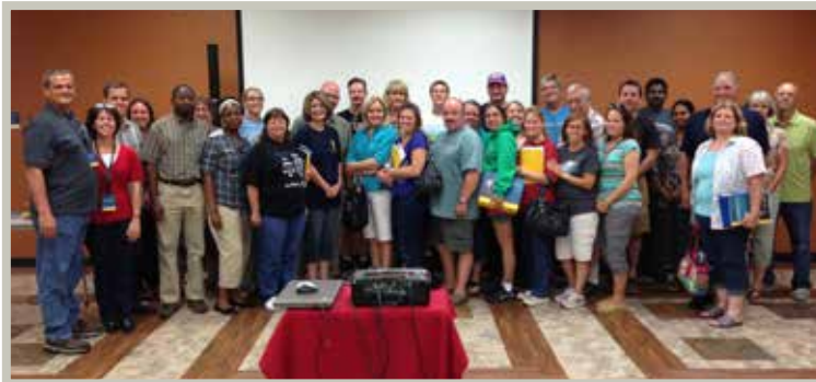
The Joshua church’s Financial Peace University resulted in 24 credit cards closed and $50,000 in personal debt paid off for the participants, in addition to other financial goals that were attained.

The difference made in the lives of the attendees over the course of the nine-week training was astonishing. A surprising 24 credit card accounts were closed, an additional $71,000 was saved in personal accounts, and almost