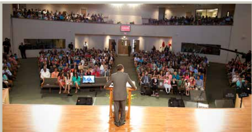
GYC En Español was recently held at the Keene Spanish church.