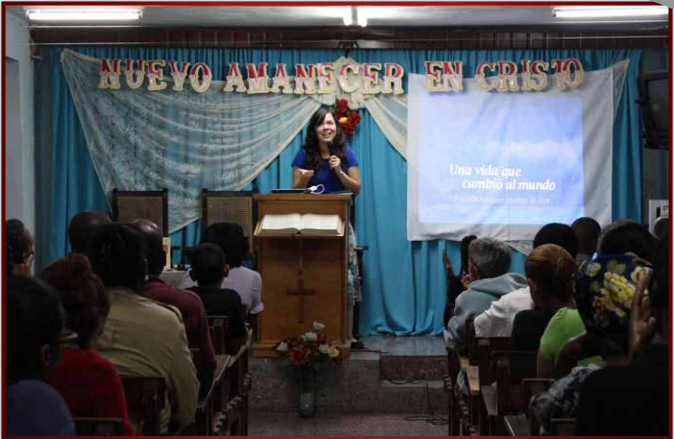
Students from Ouachita Hills Academy and College learn to actively share their faith and frequently go on mission trips where they are involved in preaching the gospel.

dents regularly to door-to-door literature evangelism programs. This not only helps students pay for their education, but also helps to financially support the ministry. They have even canvassed ASI books. While canvassing, students encounter many souls who are hungry for the gospel, and some who are even on the verge of death who need a last-minute encounter with Jesus Christ.