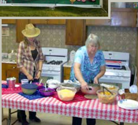
Top: The Deridder church held a "Hayday" Vacation Bible School.