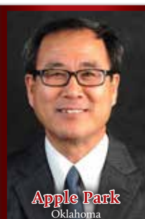
Apple Park Oklahoma