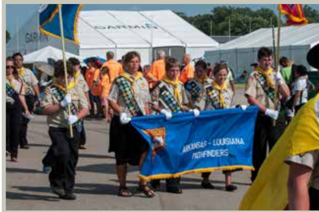
Arkansas-Louisiana Pathfinders at Oshkosh.