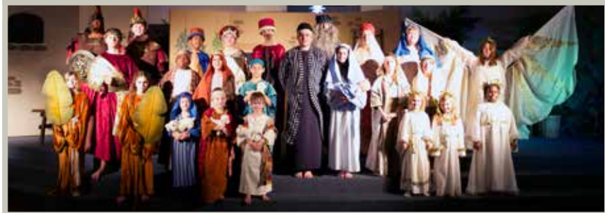
Top left: Shepherds adore the baby. Top right: The Nativity. ▲ The cast and crew.