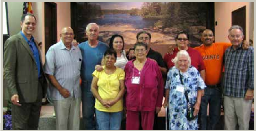
A group from the Deming English church.