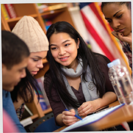
Ready to Learn