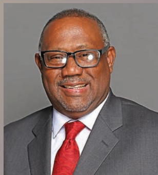
Daniel Sanchez Publishing