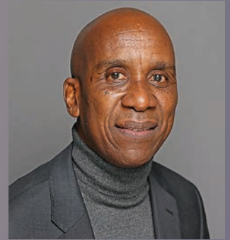
Bancroft Daughma Sabbath School