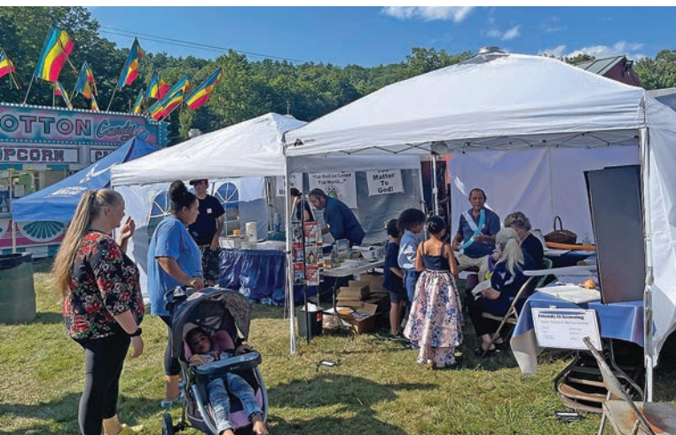
Parents observe as children receive balloon sculptures at one of the tents.

The Estabrook school booth was also very popular. Children received animal balloons as parents learned about the benefits