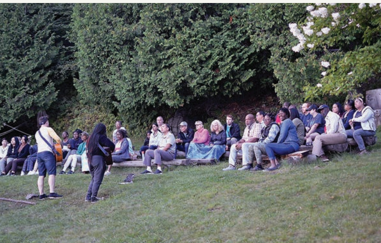
Attendees sing during worship at Joy of Troy church's yearly retreat at Camp Cherokee in Saranac Lake, New York.