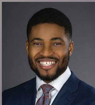
Clavour Tucker Communication