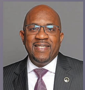
Lincoln Smith English Ministries