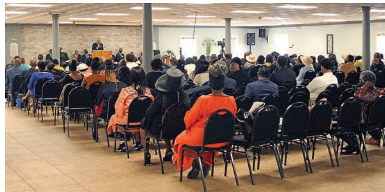
The Northeastern Conference Personal Ministries Federation celebrates its 54th annual conference at Camp Victory Lake in Hyde Park, New York.