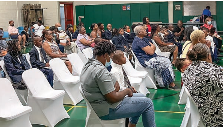
Northeastern Adventist Academy Hartford Campus students, parents, teachers, administrators, and stakeholders attend the September 3, 2022, consecration and dedication service.