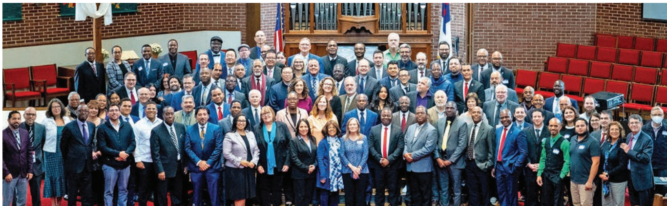
Southern New England Conference employees and volunteer leaders pose for a photo during workers meeting at the College Church in Lancaster, Massachusetts.