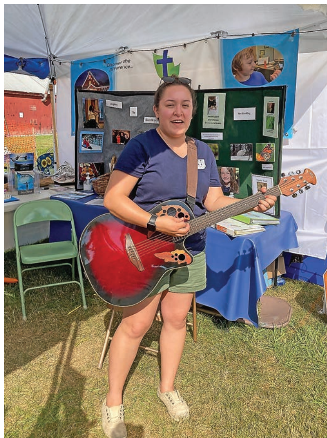
A volunteer plays music to draw passersby to the Estabrook school tent at the Cornish Fair.

Volunteers offered free bottles of water to all who walked by the two exhibit tents. As guests approached the tents, they could see three backdrop posters. One poster asked the question: “Does Life Matter?” The second read: “For God So Loved the World. . . .” The third stated: “You Matter to God.” Visitors could choose from free literature on display, such as pocket versions of SIGNS OF THE TIMES , THE DESIRE OF AGES , and STEPS TO CHRIST . Guests also received a business card with each bottle of water. One side of the card had the name, address, contact information, and worship hours of the Claremont church; the other side had the same information for the Plainfield church. Both children and parents