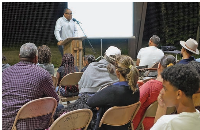
Members from the Greater New York, New York, and Northeastern conferences participate in New York Conference's annual Hispanic retreat.