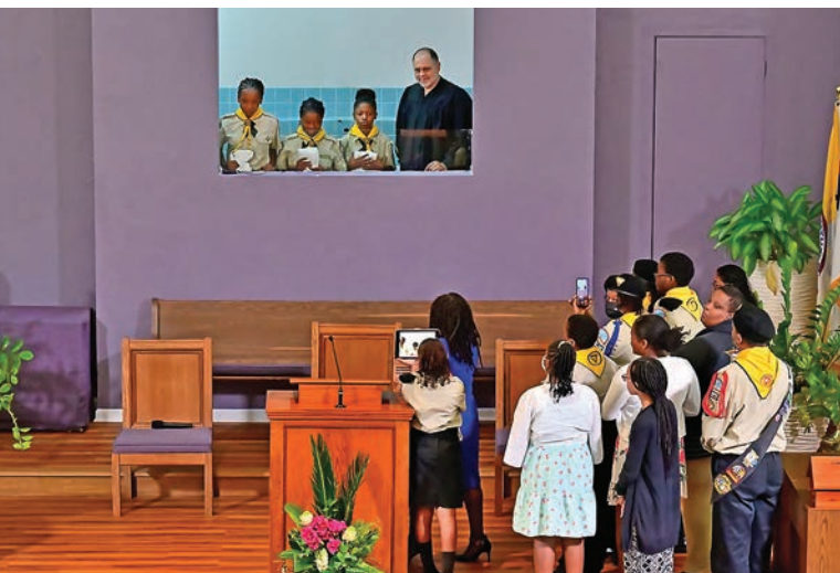
Family and friends watch as three young people who gave their hearts to the Lord during the “10 Days to Finding Love and Happiness” series prepare for baptism.

The true beauty of the presentations was that each one was based on one of the 10 Commandments. Each topic, or stepping stone, had one of the 10