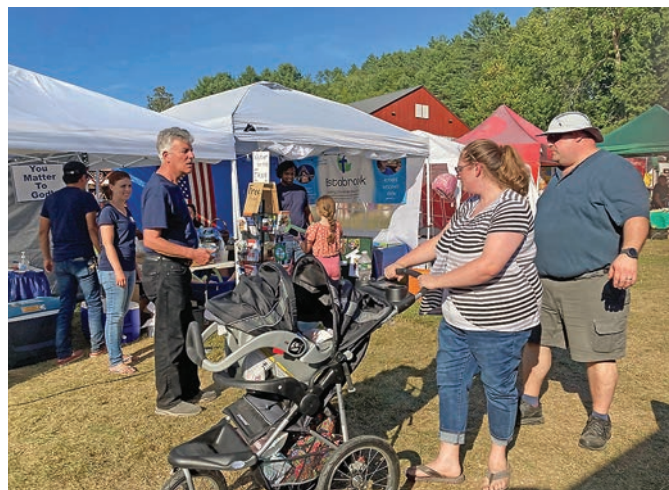
Visitors talk with a volunteer staffing the Claremont/Plainfield church tent at the fair.