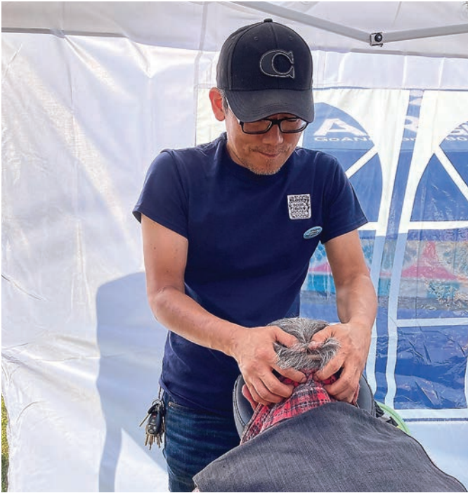
A visitor to the booth enjoys a relaxing massage.