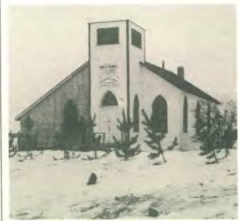
The church at Hobbema with the new addition for mother's room and washroom facilities.

The church and school in Hobbema are the beginning of many such projects of ministry to the native tribes of Alberta.