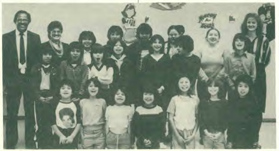
With their teachers, 20 children attend the first native school in Canada operated by the Seventh-day Adventist Church. (100 applied - only room for 20 could be found.)