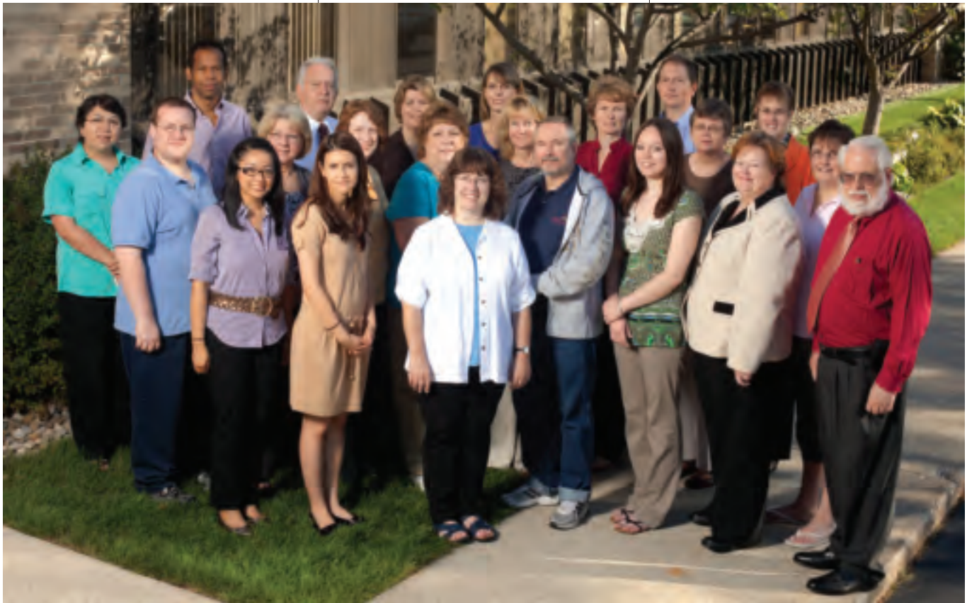
The staff of Griggs International Academy and Griggs University gather outside their new building on the campus of Andrews University in Berrien Springs, Michigan.