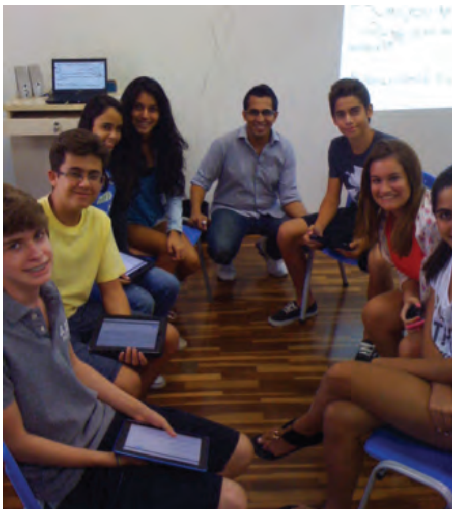
Ninth-grade students at Objetivo Sorocaba, a Griggs-affiliated school in Sorocaba, Brazil.