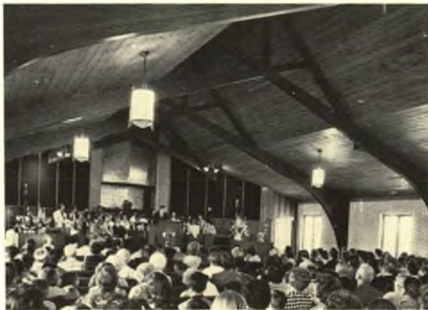
Interior of the new Adrian Church.