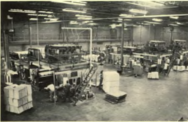
This is the press room of the W. F. Hall Publishing Company where Steps to Christ was produced.