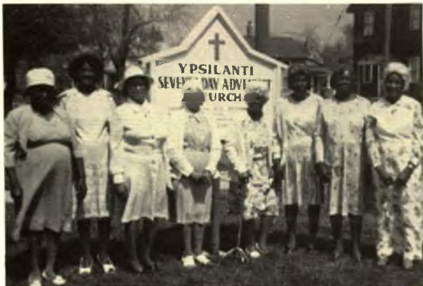
Senior citizens of the Ypsilanti Church enjoyed a special program in their honor.