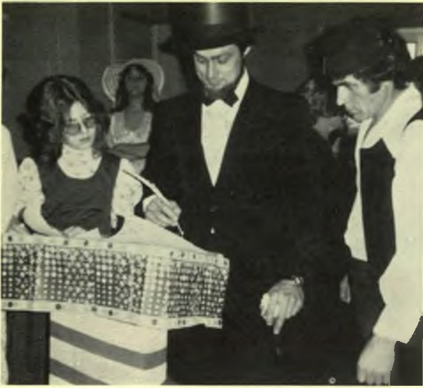
Abe Lincoln was one of the historical personages portrayed.