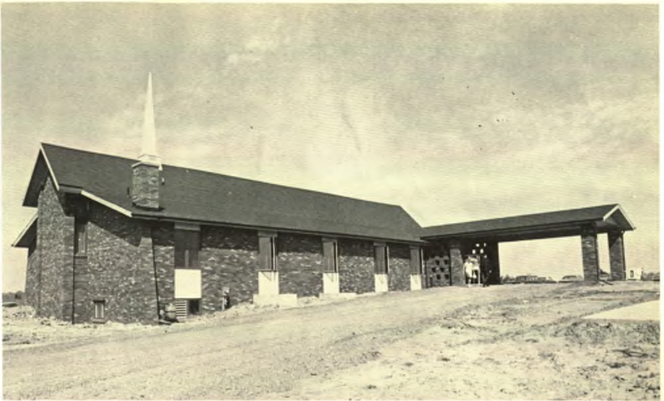
Exterior of the Adrian Church on opening day.